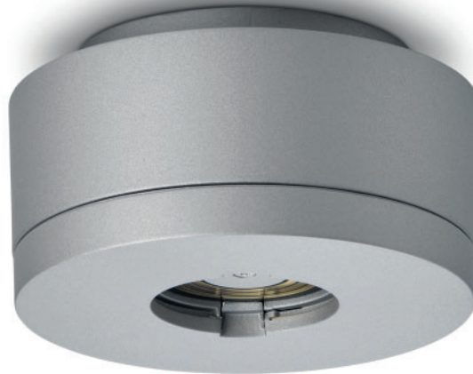
Fig. 1: Plug & Light canopy with Plug & Light light socket with bayonet